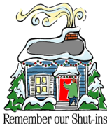
Remember our Shut-ins